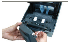
Auto-Cutter : Easy installation